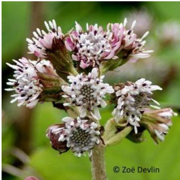
Figure 7 Winter Heliotrope