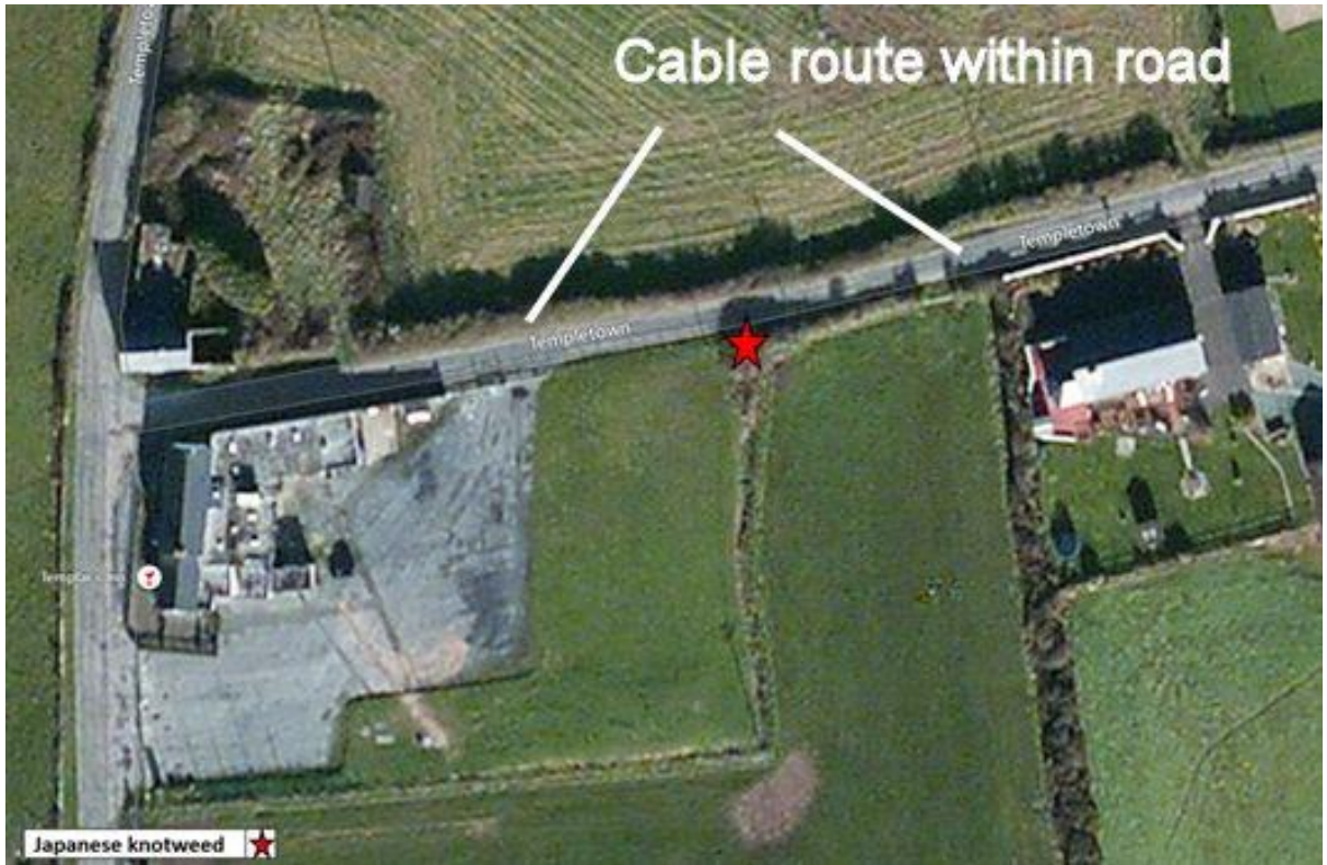
Figure 1. Location of the high-risk invasive species Japanese knotweed,