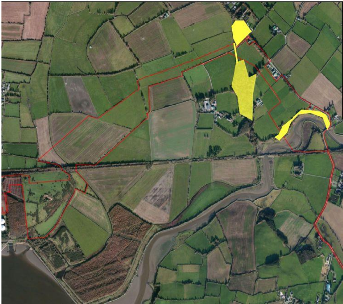
Figure 3 Location of Rhododendron | not to scale