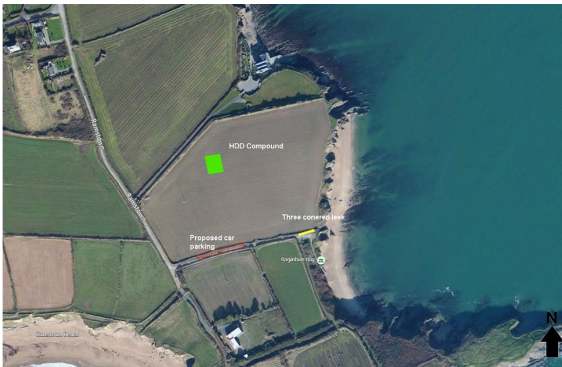
Figure 2 Location of Three-cornered Leek | not to scale