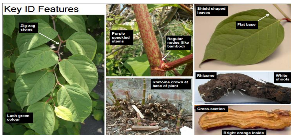
Figure 5. Key features of Japanese Knotweed

The plant has woody underground rhizomes which can extend 7m laterally from a parent plant. The leaves and stems die back during winter, but growth is extremely rapid during spring. The plants spread mainly through fragments of rhizomes -as little as 0.7g of material or the size of a small fingernail is sufficient-and through cut stems. Stem material cannot regenerate once it has dried, but rhizome material may be viable for up to 20 years in the soil. Thus, control of this species is very difficult. The characteristics of this species is shown in Figure 4 and Photographs 2 and 3 .