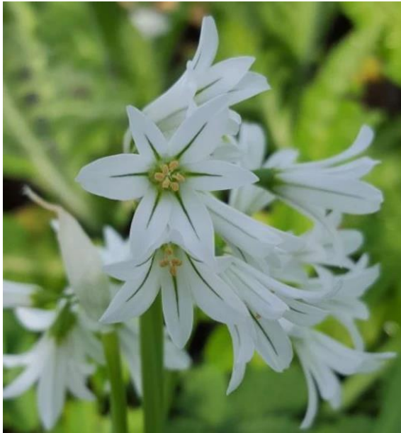
Figure 6: Three-Cornered Leek